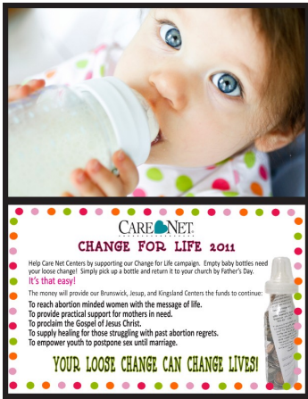
Sample Flyer—All Flyers & Inserts online at www.ourpartners.org